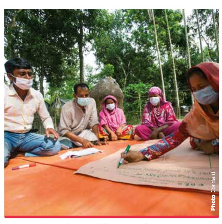
WASH mapping exercise as part of the SONGO project.