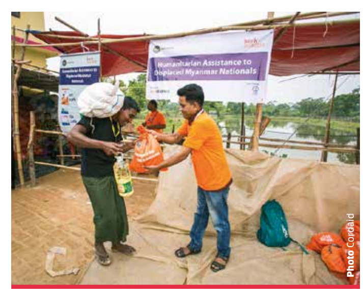
Food assistance to forcibly displaced Myanmar nationals.

Read more about our work in Cox's Bazar on our website.