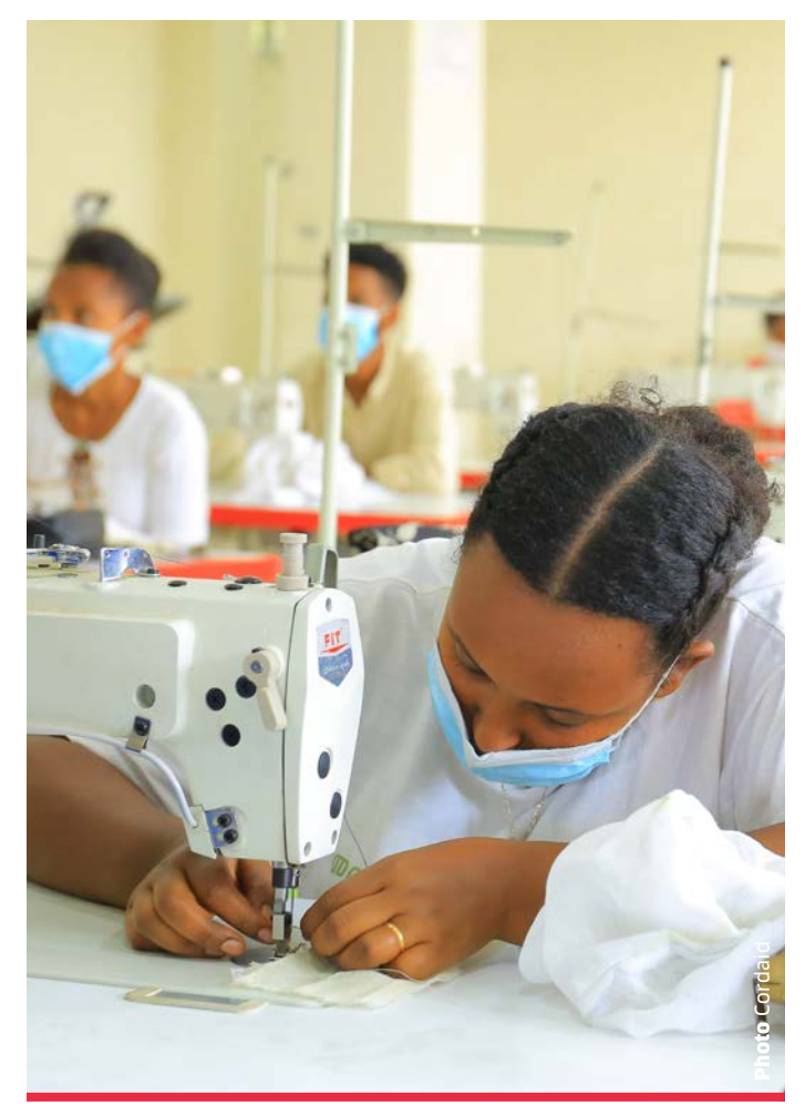
Youth participating in the JSE project in Bahir Dar.

Read more on the Cordaid Ethiopia website.