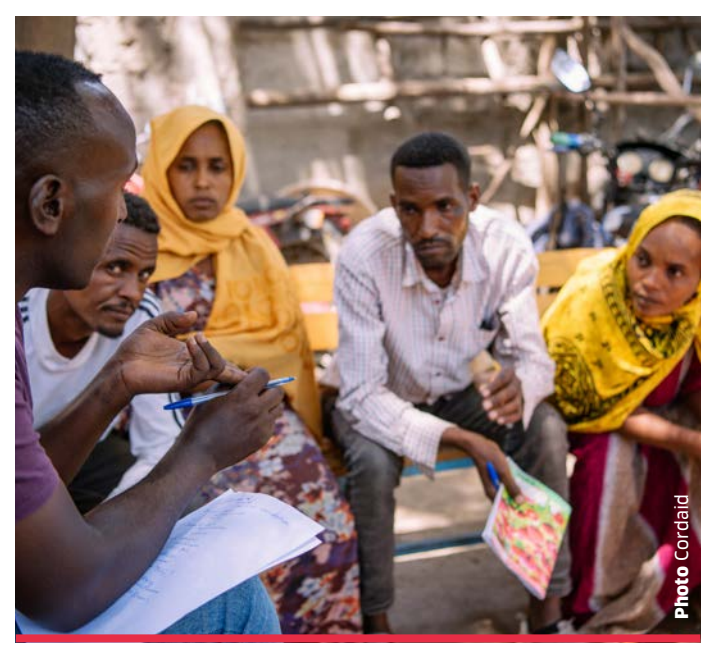
Smallholder farmers meet as part of the STARS project