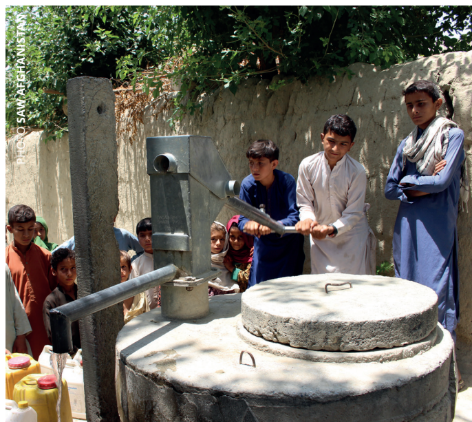
> Solar-powered water supply in Mohmandara, Afghanistan, realised by partners of DRA.